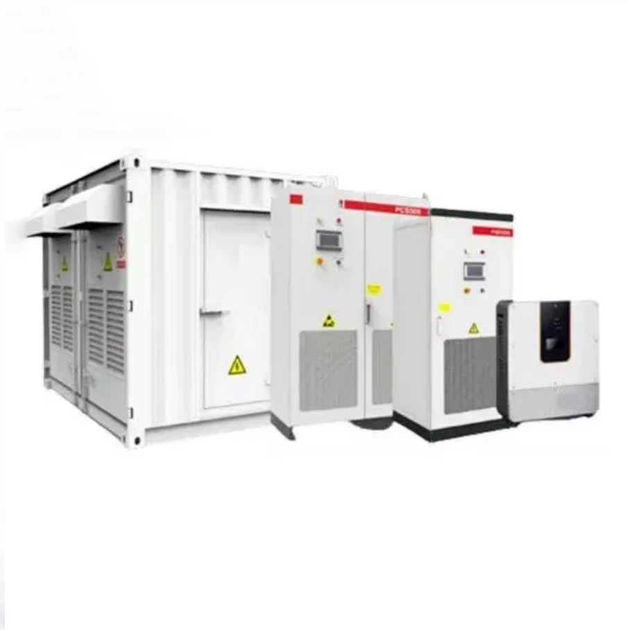
Photo summary of solar container policy development trends